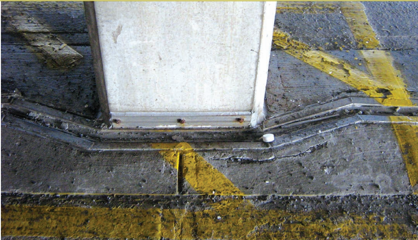
■ STRUCTURAL COLUMNS AND THE JOINTS AROUND THEM SHOULD BE WELL IDENTIFIED.

inexpensive but are much more harmful to the structure than ureas or calcium magnesium acetate. It is recommended that sodium or calcium chloride (rock salt) deicers not be used. Deicing chemicals should not be used until the parking structure is at least one year old.